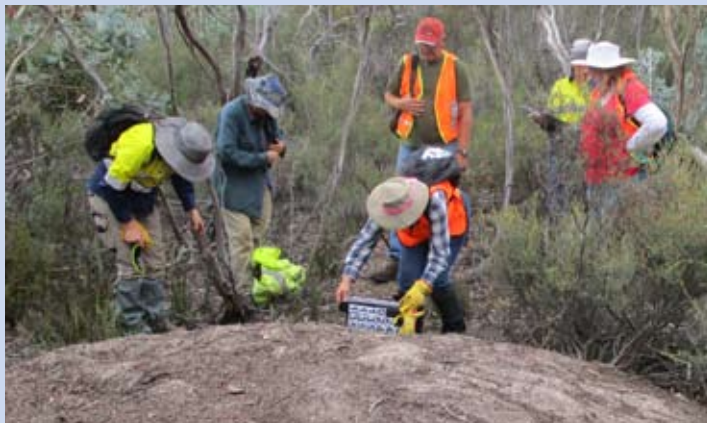
Malleefowl monitoring training near Kalgoorlie

We have worked very closely with 16 NRM agencies across Australia to secure actions for Malleefowl conservation in the new Australian Government National Landcare Partnerships Program.