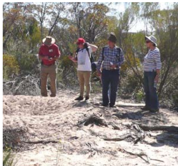
A team of volunteers gathering data on Malleefowl mounds

At the 2004 Malleefowl forum in Mildura it was decided that all this information needed to be gathered into the one place...a national database! This immediately highlighted the problem that not everyone was collecting the same data in the same way. Some people would record the location and if the mound was active, others recorded a lot of extra information on things like size and shape of mounds and even fox scats. We needed to make sure that the information gathered was uniform and easily fed into the database. This led to a set of guidelines on collecting data and saw the birth of the National Malleefowl Monitoring Manual .