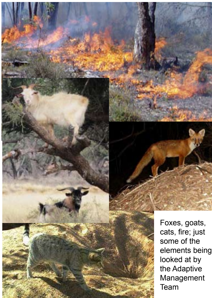
Foxes, goats, cats, fire; just some of the elements being looked at by the Adaptive Management Team

Some people might argue that this is just common sense and that we need to do all of these things to help save the Malleefowl. The problem is that there's just not the money to do it all across the vast range of our bird...we have to be strategic and do work where it will have the best results. Added to this is the fact that past actions have had mixed results, even with something as seemingly obvious as fox control.