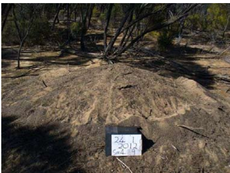
A mound ready for recording and adding to the National Malleefowl database

With the growth of the digital age, we have seen vast improvements with data collection (using Palms and then GPS PDA's and now smartphones), gathering of digital images of each mound, and the growth of the data base into an incredibly useful tool that also allows volunteers to see the outcome of their combined efforts. All volunteers can get access to the site. Of particular interest is the file of all past photos of the mounds. Each year another photo is added for each mound, resulting in a slide show of the many stages a mound can go through. Keep in mind that our wonderful volunteers now collect information on over 3000 mounds annually. The database is also an incredibly powerful tool for scientists to use when analysing mound use over the years, although its main function is to track trends in Malleefowl populations. Remember that we use mound activity as the best indicator of species survival; the greater the number of active mounds, the more Malleefowl out there in the bush.